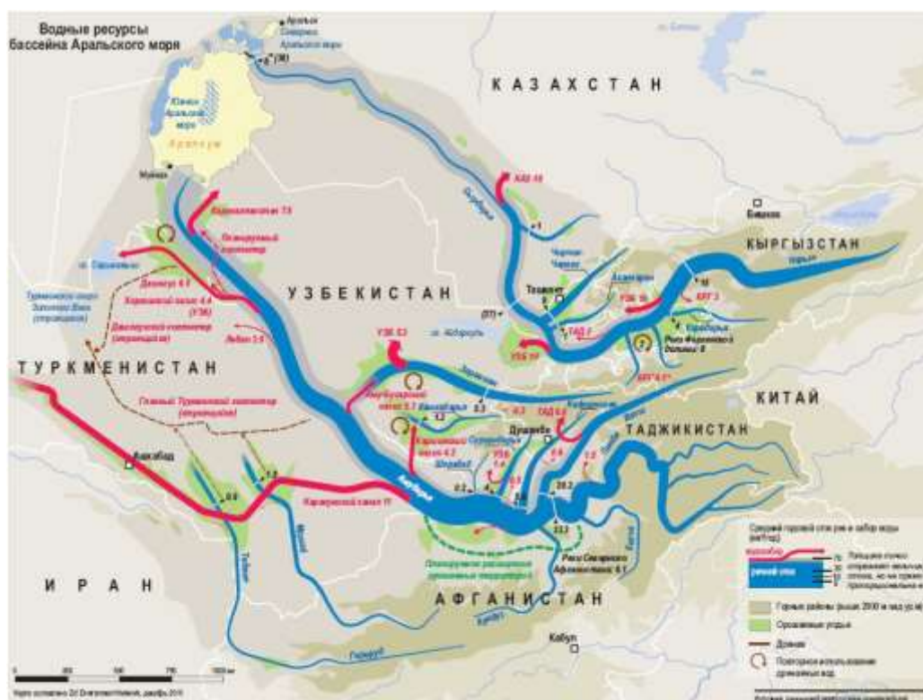
Figure 1. Map of water resources of Central Asia

Figure 1 below shows a map of water resources of Central Asia, which shows the inflow and flow of water resources of our country (Fig. 1).